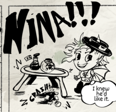
I won Solstice Shimmer!